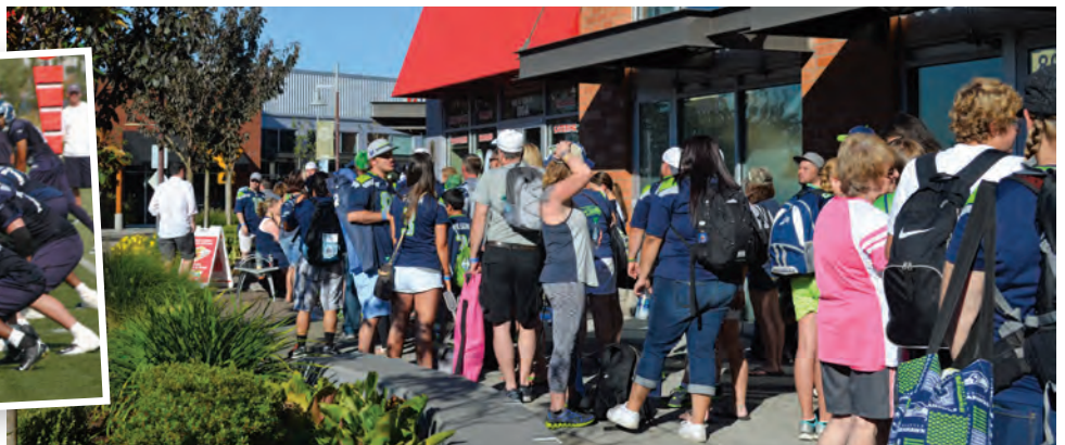
Fans line up at The Landing for buses to training camp.